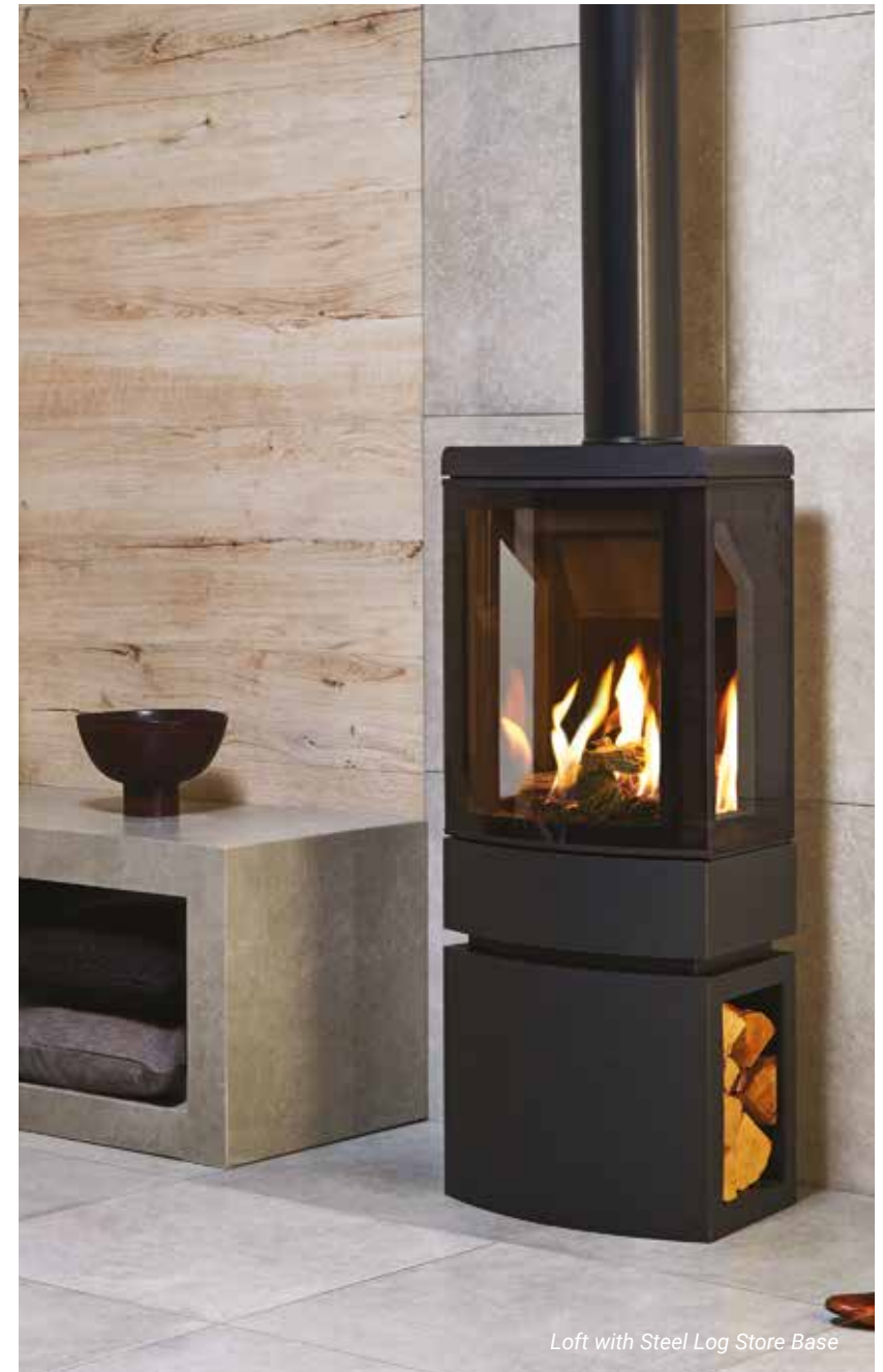
Loft with Steel Log Store Base

Stove Flue Pipe Balanced flue versions of the Loft must only use the 6" stainless steel flue provided. Gazco recommends the use of 5" matt black enamelled stove pipe with the conventional flue version of the Loft.