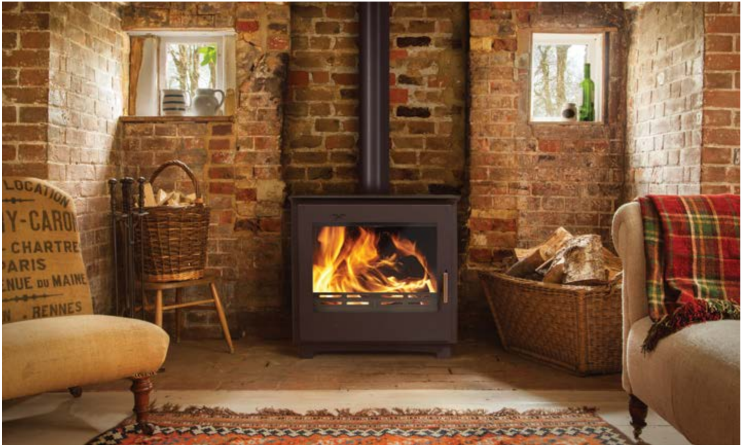
Model shown: Ecoboiler Wood

Our dedicated wood boiler features one of our biggest viewing glasses, providing an unhindered view of its glowing fire. Featuring a modern design, clean-cut lines and a sleek handle, the wood boiler is certain to become the centre point of any room in an energy-conscious home.