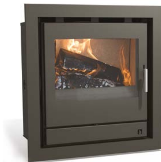
Ecoboiler 12 Cassette | 11.8kW A