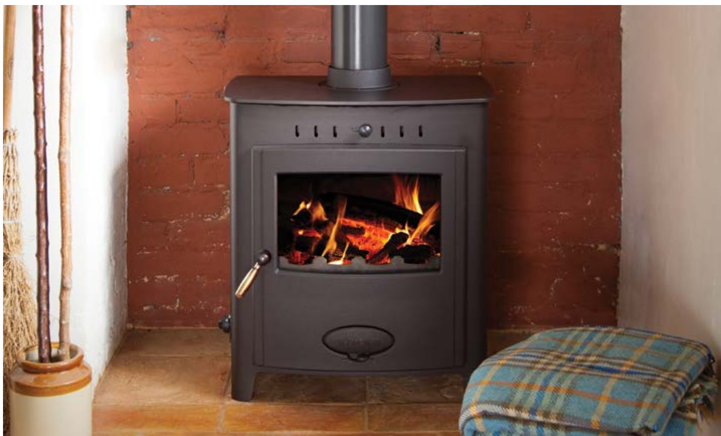
Model shown: Ecoboiler 16 HE | 13.6kW

Providing more than just superior performance, the Ecoboiler HE (high efficiency) has a large fire door glass and soft curved lines, offering an attractive focal point for any living area. On top of its stylish appearance, discreet thermostatic control and three bar operating pressure, its ability to produce 50% more heat to water than other boiler stoves ensures the Ecoboiler is the ultimate heating companion.