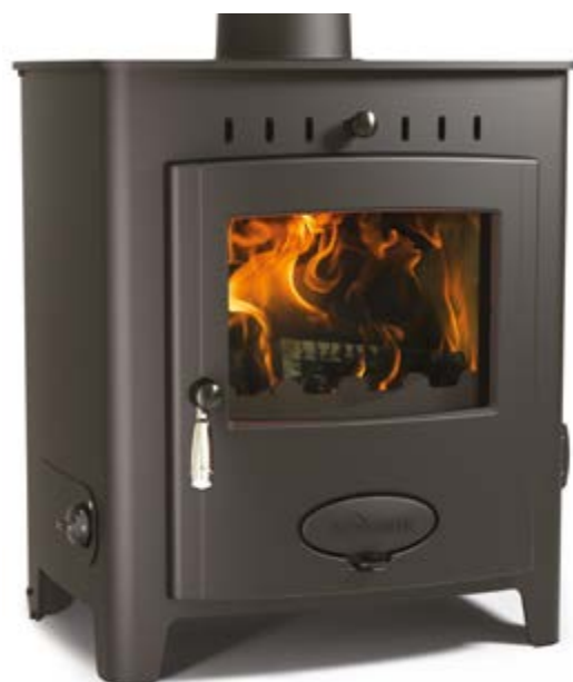
Ecoboiler 12 HE | 12.1kW A

Available with 12.1, 13.6, 18 or 22.5kW outputs