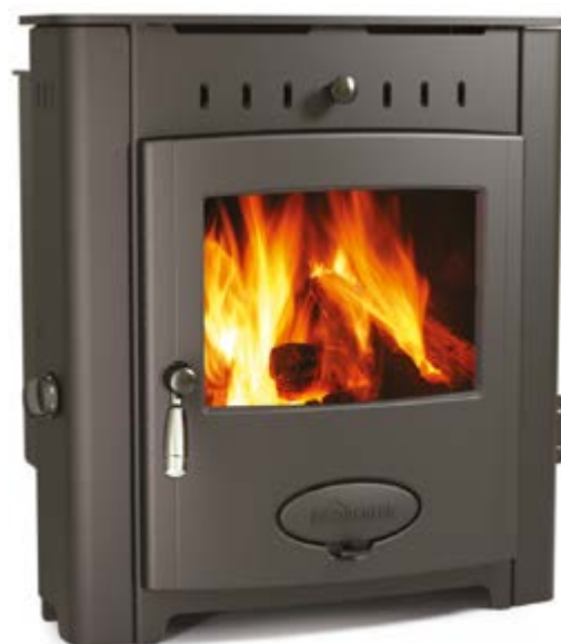
Ecoboiler 16 HE Inset | 16.1kW A